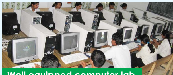
Well equipped computer lab.