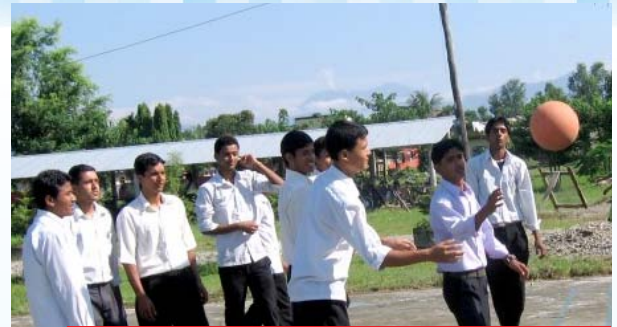
Standard basketball and football ground.