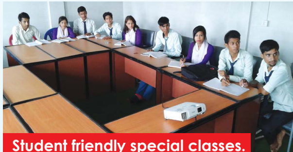
Student friendly special classes.