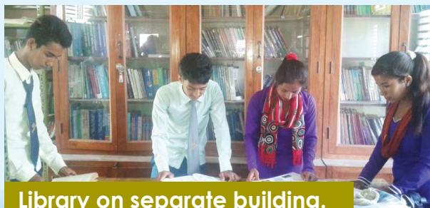
Library on separate building.